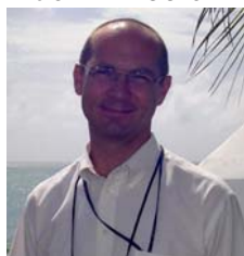
Teaching Section Secretary