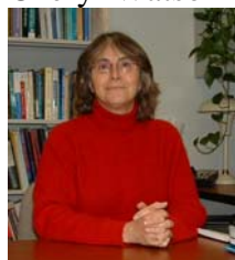
Liaison with Industry