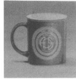
The Centennial Coffee Mug

Centennial Coffee Mug is a replica of the Founders Cup with the Centennial Seal imprinted in white on a radiant cobalt blue mug. The cost for the coffee mug is $7.50.