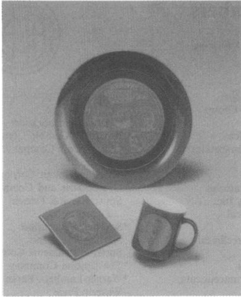
The Centennial Founders Set

The Centennial Founders Set is a limited production of ceramicware commemorating the 100th anniversary of the founding of the American Physiological Society. Each piece—plate, cup, and tile—is fired in a radiant cobalt blue porcelain and etched in 23-carat gold. The face of the 10-inch plate features a reproduction in gold of the Centennial portraits of the five founders and inscribed on the back is a brief history of APS. The tile features a gold reproduction of the Centennial Seal and the cup has both the founders' portraits and Centennial Seal embossed on the sides. A Founders Plate is to be donated to the White House Collection of Commemorative Plates in Washington, D.C.