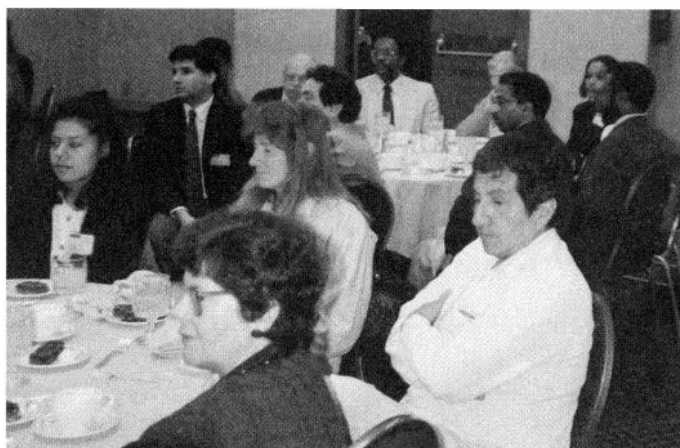
NIDDK Award Winners