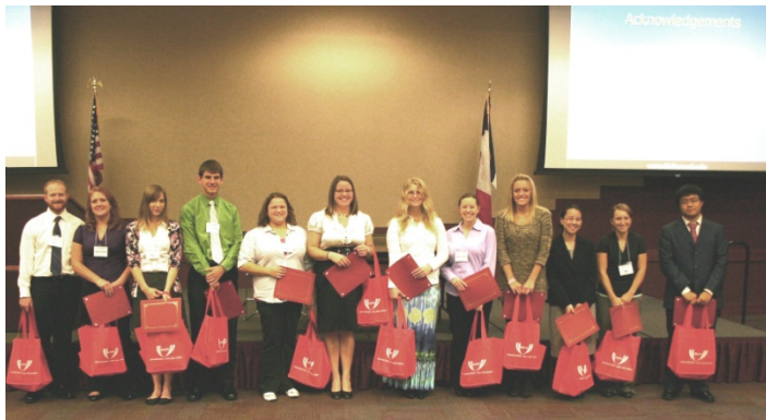
Undergraduate poster presenters at the 2011 Combined Meeting of the Iowa and Nebraska Physiological Societies