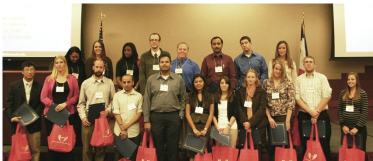
Graduate poster presenters at the 2011 Combined Meeting of the Iowa and Nebraska Physiological Societies