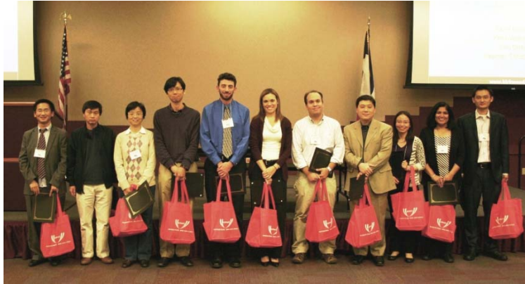
Post-doctoral poster presenters at the 2011 Combined Meeting of the Iowa and Nebraska Physiological Societies