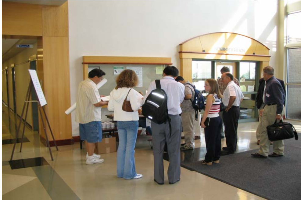
Members arrive from Oklahoma City. Membership dues are what!?