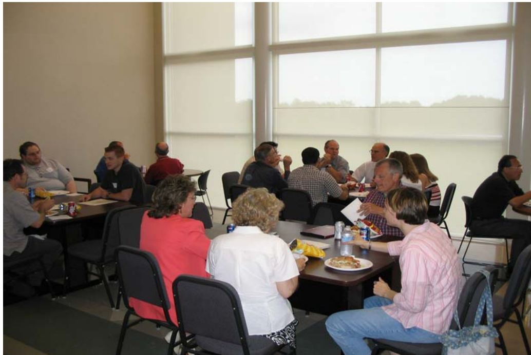
OSP luncheon. The real reason for coming.