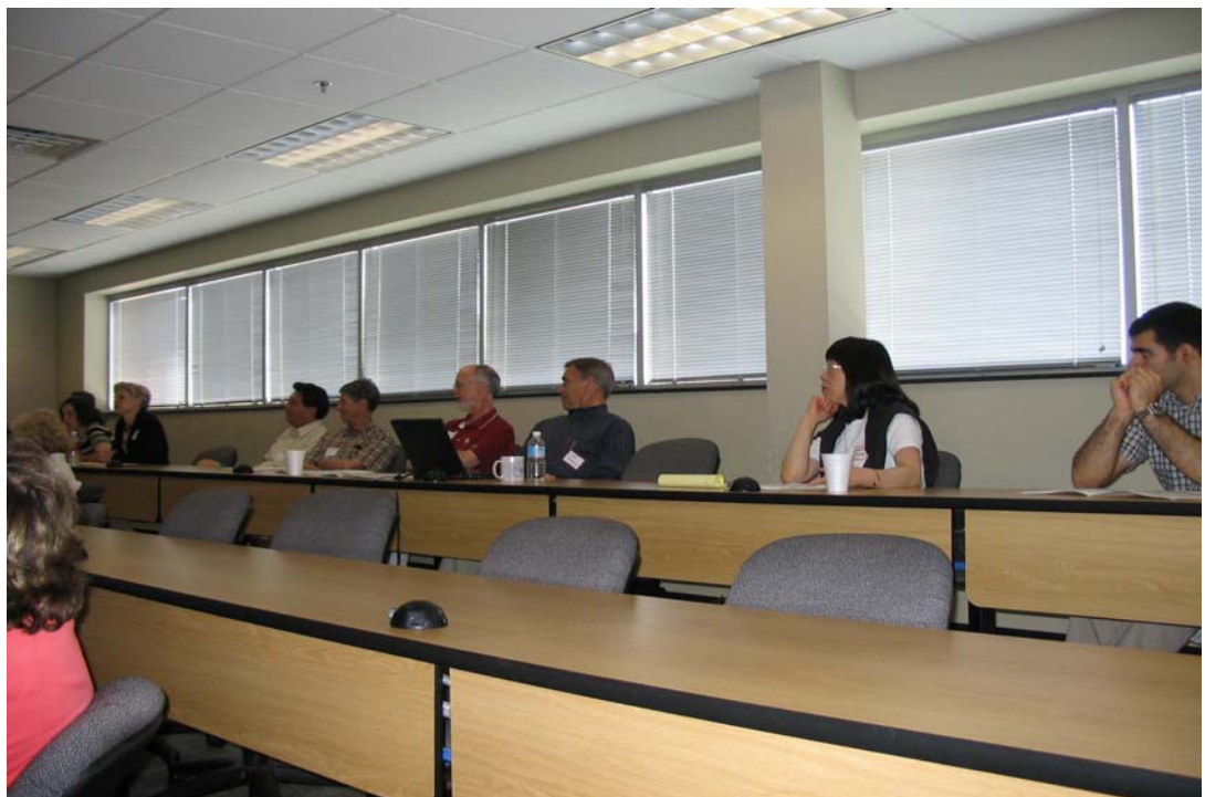
Attentive OSP members engrossed in presentations. Went back to sleep after photograph.